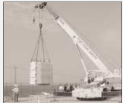
Damaged transformer from Waka Substation being sent for repairs. The transformer was shot by vandals on August 7.