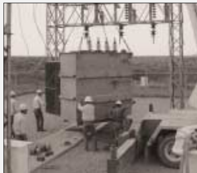
NPEC employees work to install a substitute transformer in the Waka Substation after vandals shot it on August 7. The substitute was loaned from Tri-County EC in Hooker, OK.