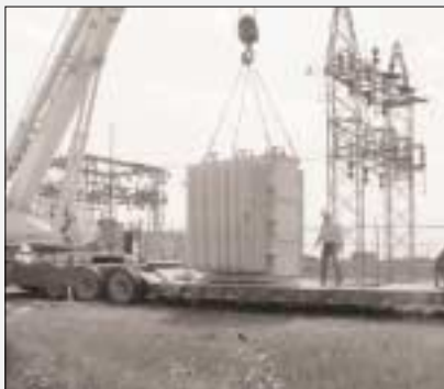
Workers load damaged transformer that was shot by vandals on August 7.

KWh costs up to now have continued to be stable and about one cent per kilowatt-hour less than last year. The savings are due to stable fuel prices nationally and the efficiency of Mustang Station, our generation plant and major power source. We hope that fuel cost will continue to be reasonable throughout the winter so that North Plains can continue to pass on these savings to you, our members. Your complete satisfaction is our goal, and we continue to work in an effort to meet your expectations and standards.